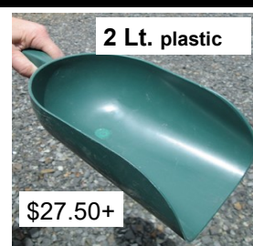
2 Lt. plastic