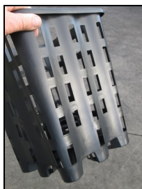
9 Lt. Pro-Pot from $2.00+ 23x23cm