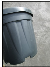
6Lt. Fenice pot from $1.00+ 21x20cm