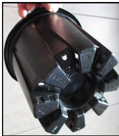
2.5Lt. Fruit pot from $0.50+ 14x16cm