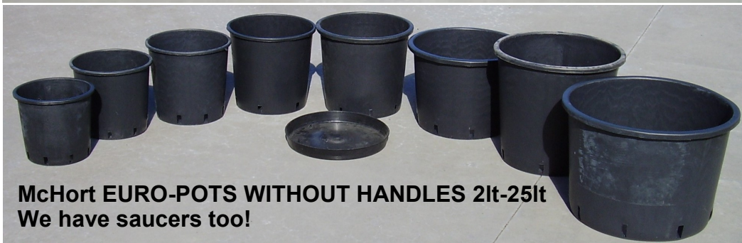
McHort EURO-POTS WITHOUT HANDLES 2lt-25lt We have saucers too!