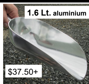
1.6 Lt. aluminium