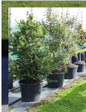
McHort EURO-TUBS WITH HANDLES 30lt-160lt