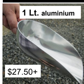
1 Lt. aluminium