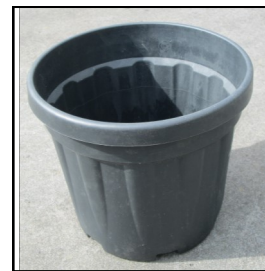
10Lt. Fenice pot from $1.50+ 26x24cm

Minimum order quantities apply for these super discounted prices, call for details.