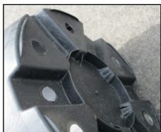
McHort FENICE POT 20-32cm 4 sizes