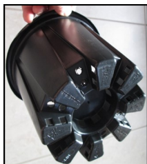
McHort ERACLE SUPER POT 2.5Lt 17cm