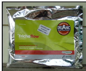
TRICHOFLOW NURSERY DRENCH FORMULA