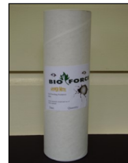
HYPERMITES BIO-CONTROL OF SCIARID