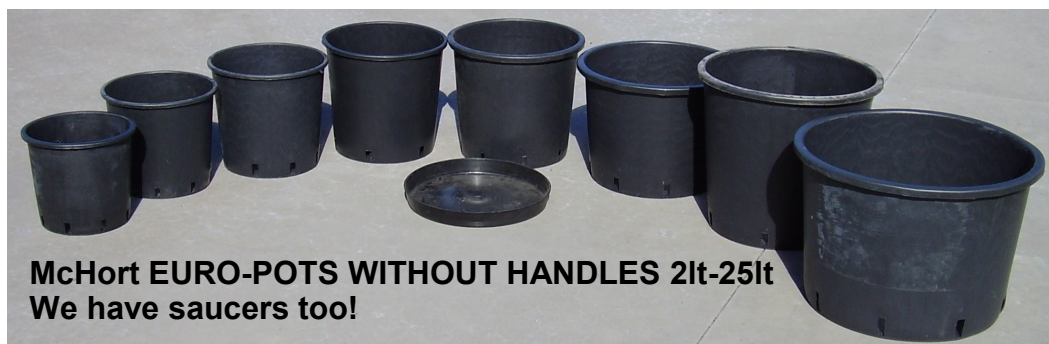
McHort EURO-POTS WITHOUT HANDLES 2lt-25lt We have saucers too!