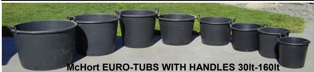
McHort EURO-TUBS WITH HANDLES 30lt-160lt